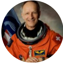
Prof. Claude Nicollier