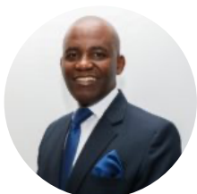
Dr Faustine Ndugulile

Unit Head, Digital Health Capacity Building and Collaboration World Health Organization